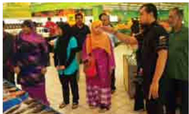
Job applicants being told what goes on behind the fresh food counter.