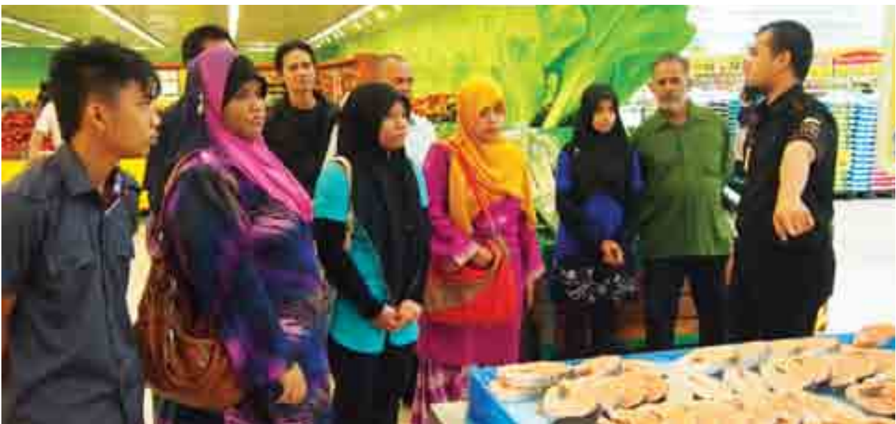
GCH representatives taking the MyKasih job applicants on an educational tour around the hypermarket to explain how it operates.

Dedicated to empowering the underprivileged through training and job placement