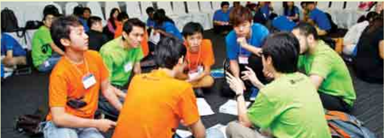
Break-out group discussions are a mine-field of creative ideas.