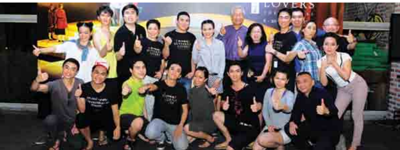
The talented artists of Dama Orchestra giving a thumbs up to a successful evening in support of a good cause!