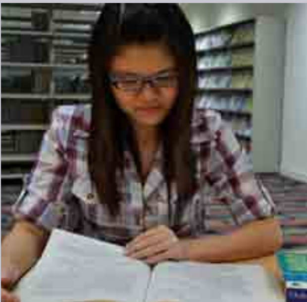
This 4.0 CGPA Accounting student spends her time studying at the college library and helps tutor her friends in their studies.