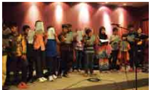
Children from the Kampung Sungai Kayu Ara singing the financial literacy theme song