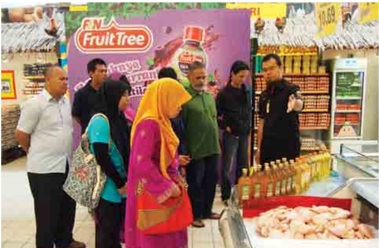
The job applicants being briefed on why Giant organises their aisles the way they do - home items first and wet food items at the end.