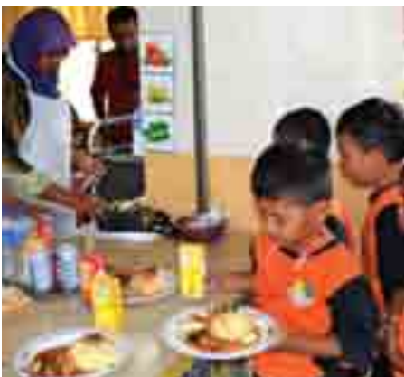
The student beneficiaries making their first purchase at the school canteen.