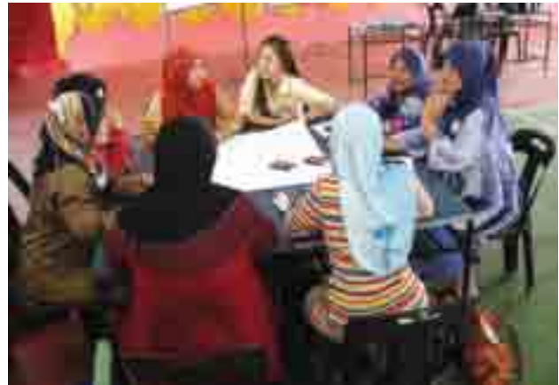
Top and above: The ladies learning the importance of communication, how to communicate effectively and clearly while being a good listener.