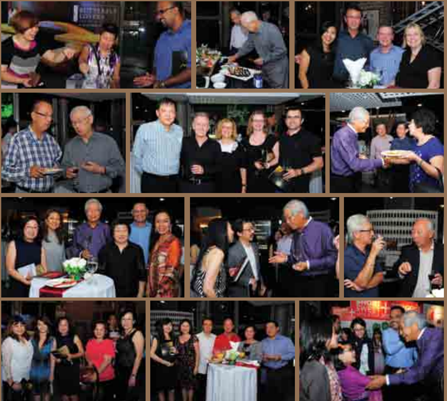
The evening was light and happy, with business partners, friends and family members enjoying refreshments served before and after the show.