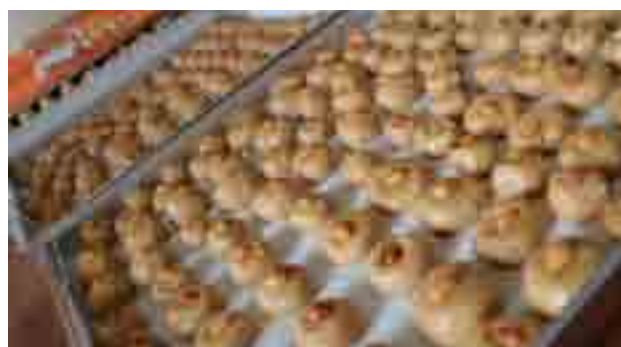
Delicious peanut cookies baked by the participants.