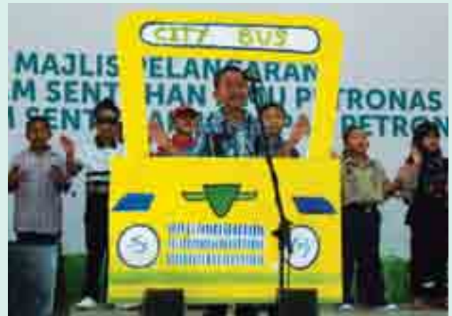
The lively performances by the PSIP students of SK Pengerang, SK Sungai Rengit and SJKC Yok Poon.

PETRONAS had introduced the minor scholarship programme since 1975, which aimed to help academically-excellent students from low-income households. Up until 2010, this minor scholarship programme has benefitted 14,273 students from 697 secondary schools.