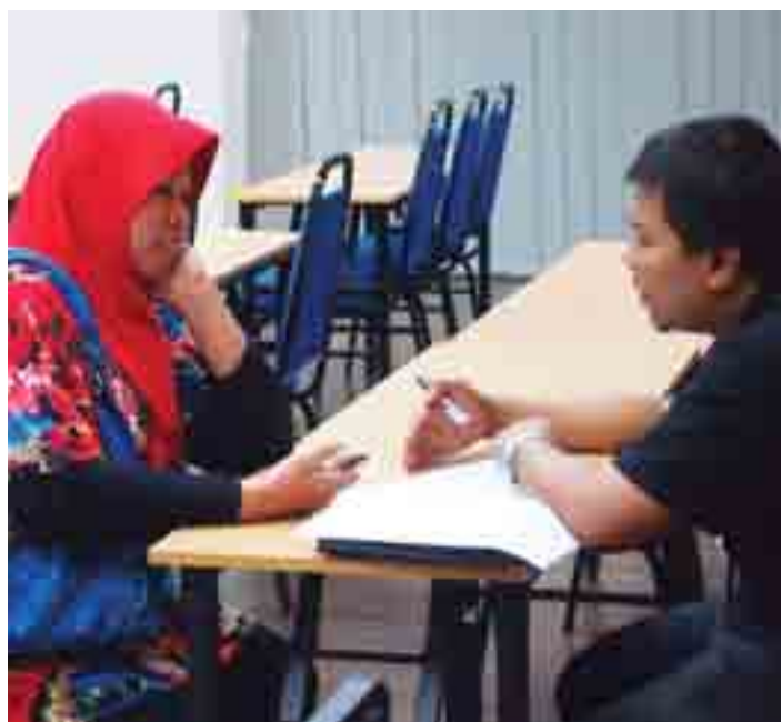
GCH's HR staff explaining the hiring process, job scope, benefits and company expectations to the applicant.