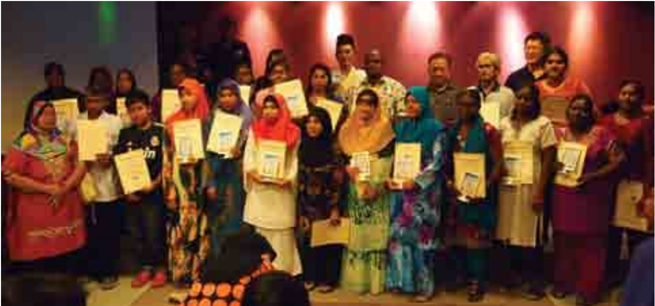
Proud and gleaming graduates of Level 1 & 2 of the PPKSKA Financial Literacy programme

40 food aid recipients from DIALOG's adopted MyKasih community of Kampung Sungai Kayu Ara graduated from a comprehensive financial literacy programme in October 2013. The graduation celebration was held at the Mosaic Community Studio in Bandar Utama. Excited with the achievement, many of the graduates were eager to share their success stories to inspire and motivate others.