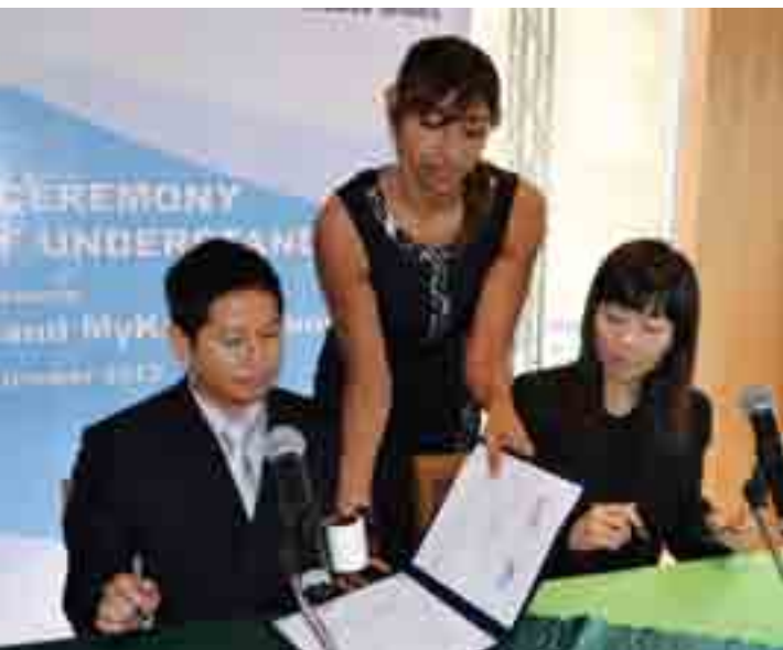
MOU-signing ceremony taking place to mark the collaboration between Mediviron UOA Clinic and MyKasih Foundation.