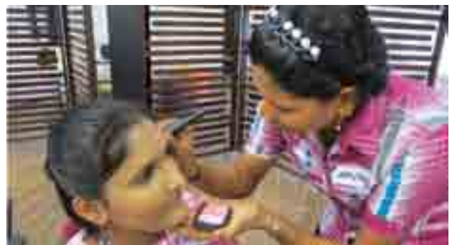
Hands On Workshop during the interview - a chance for recipients to show their skills and convince LuxAsia why they should receive the Make Up Course scholarship.