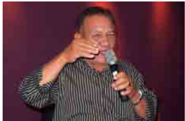
One of the graduates sharing his experience and journey after implementing what he had learned from the programme

To-date, a total of 95 Kayu Ara MyKasih recipient families have graduated at Level 1, and out of these, 57 have successfully completed Level 2.