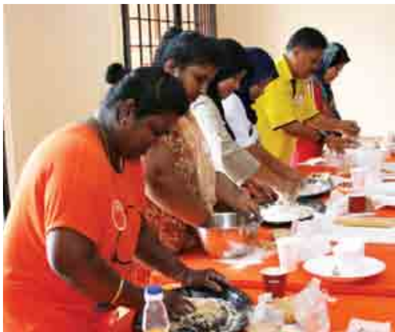
Participants meticulously preparing their peanut cookies as per the recipe taught by their trainers from TNT Express.