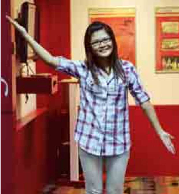
I am a proud Tun Rahah scholar!