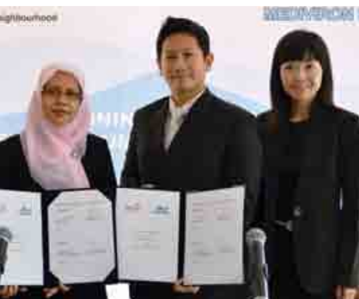
The MOU signed by the two parties, which outlines the clinic's contribution mechanism to MyKasih.