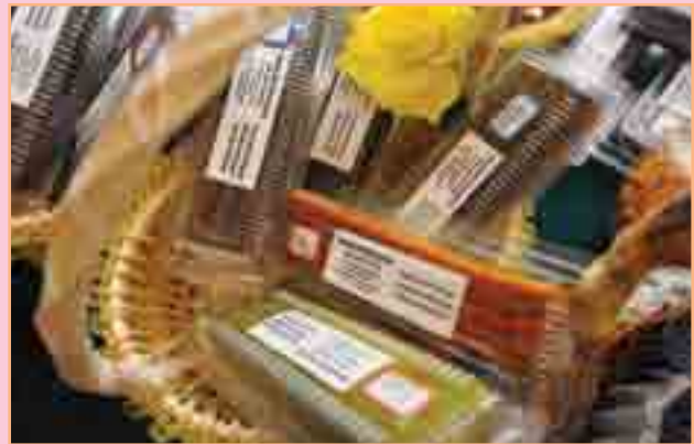
Kek Lapis Sarawak made by the successful Sentuhan Harapan entrepreneurs being put for sale during the event.

Program Sentuhan Harapan PETRONAS is a corporate social investment to facilitate the socio-economic development of underprivileged communities in Malaysia. Officially launched by the Prime Minister on 22 July 2010, the three-year programme is aimed at enhancing the skills and capabilities of the poor so that they can have a better quality of life and stay out of the poverty cycle.