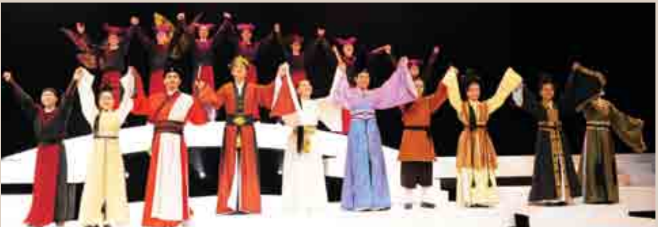
The cast of the musical, Butterfly Lovers, take a bow at the end of their moving performance.

She descends into bitter despair and begs for the grave to open up. Suddenly, the grave opens with a clap of thunder and Zhu throws herself into the grave to join Liang. Their spirits turn into a pair of beautiful butterflies and emerge from the grave. They fly away together as a pair of butterflies and are never to be separated again.