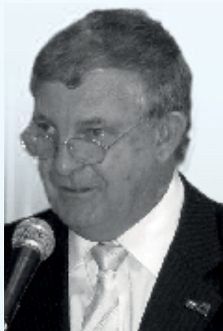
SENATOR DR CHRISTOPHER JOHN BACK