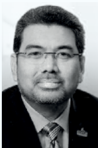
DATUK BADLISHAM GHAZALI