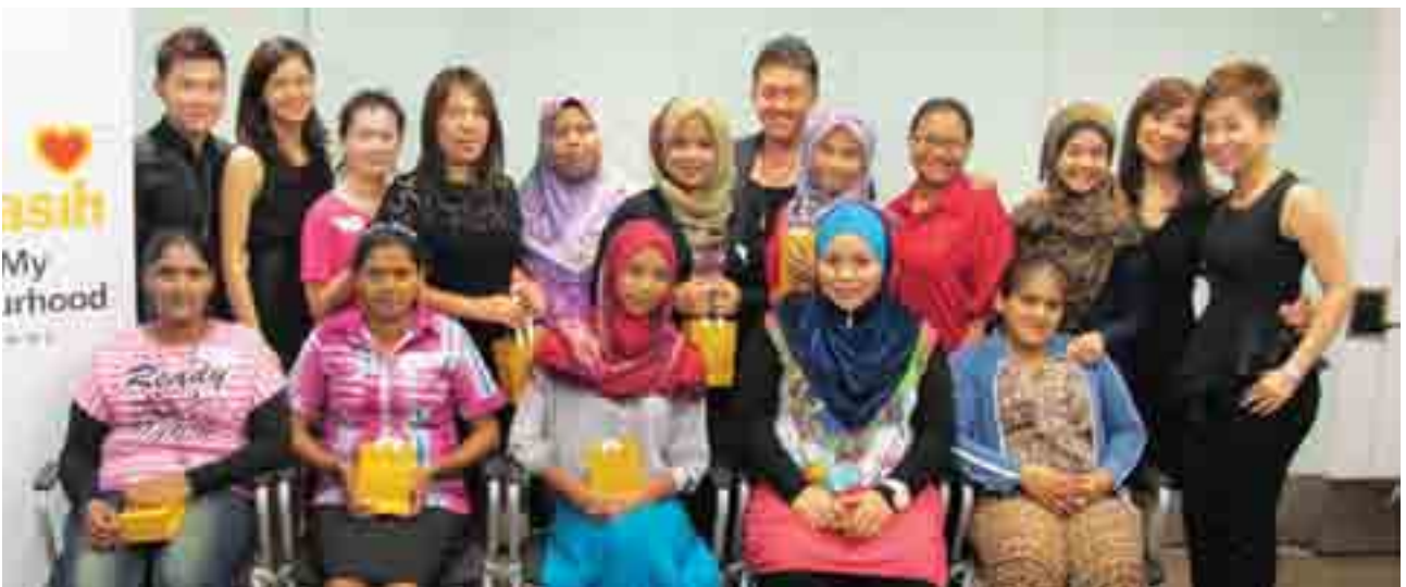
Representatives from LuxAsia and, MyKasih Foundation with the trainees.