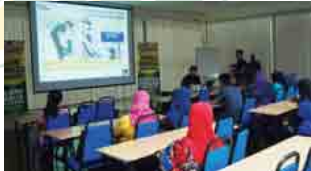
GCH's Trainer presenting the overview of GCH Retail, its mission, vision, benefits and the opportunity to grow within the company.

Earlier in July, Giant made a contribution of RM 500,000 to MyKasih Foundation through its chain of Giant hypermarkets, in support of the latter's mission of helping the poor through food aid and education.