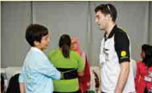
Ice Breaking session. First impression counts!