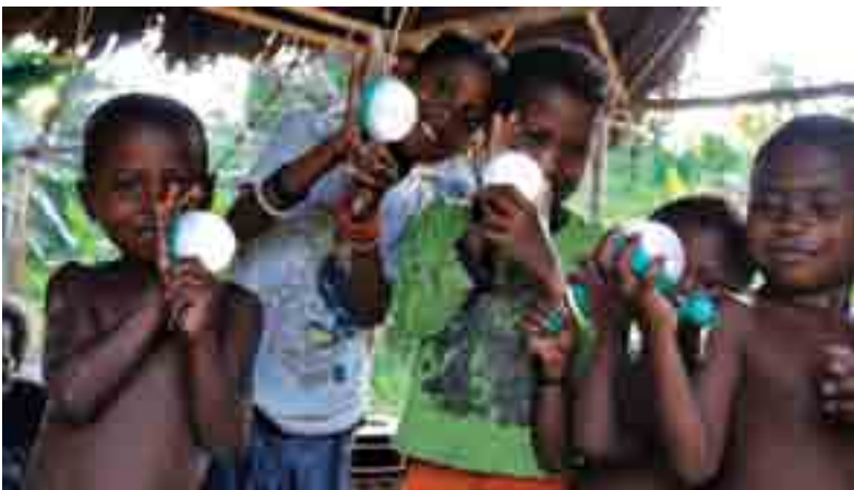
Top and above: The excited orang asli children of the Semai community in Kampung Tual, Pahang testing out the solar light bulbs.