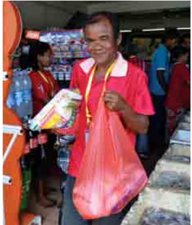
An Orang Asli recipient was all smiles after successfully purchasing basic food items such as rice, biscuits, flour, seasoning and canned food at the appointed retail store.