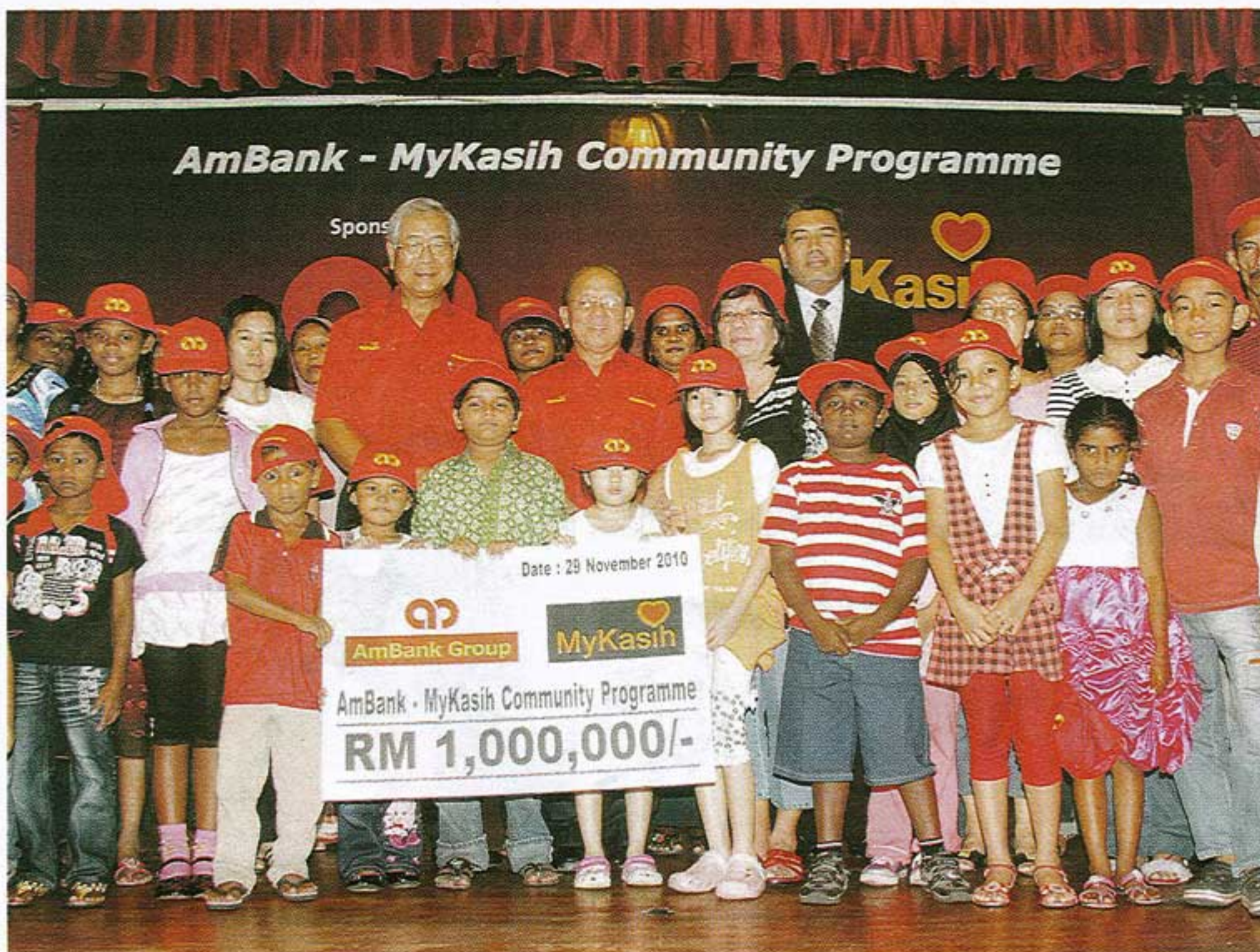
AmBank Group donates RM1 million to the AmBank-MyKasih Community Programme yearly