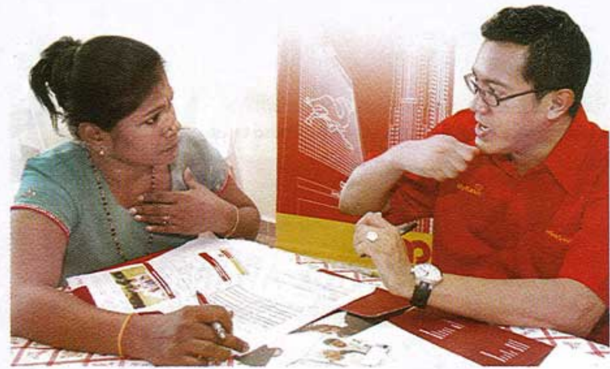
Consultation during an AmBank-MyKasih financial literacy session

The AmBank-MyKasih Community programme, through the AmGroup Foundation, is part of the group's CSR activities for which RM1 million a year has been allocated.