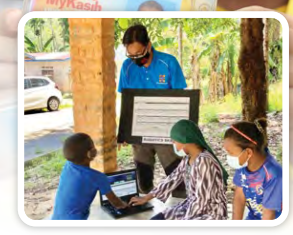
Students of SK Sungai Rual in Jeli, Kelantan, in a robotics workshop in preparation for the Virtual National Robotics Competition (VNRC).

MyKasih is a partner to the East Coast Economic Region Development Council (ECERDC) and the Northern Corridor Implementation Authority (NCIA) since 2017 and 2019 respectively on the 'empower@academik' programme. The programme is dedicated to aid students from underprivileged and low-income households in the northern and eastern regions with cashless bursaries and other educational