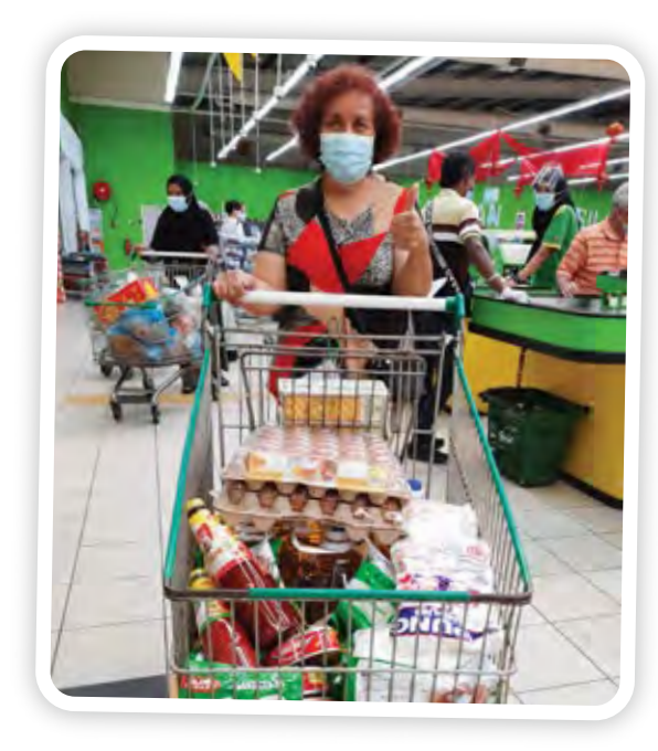
Beneficiaries are able to purchase essential food items that can last for a month or more with cashless aid.