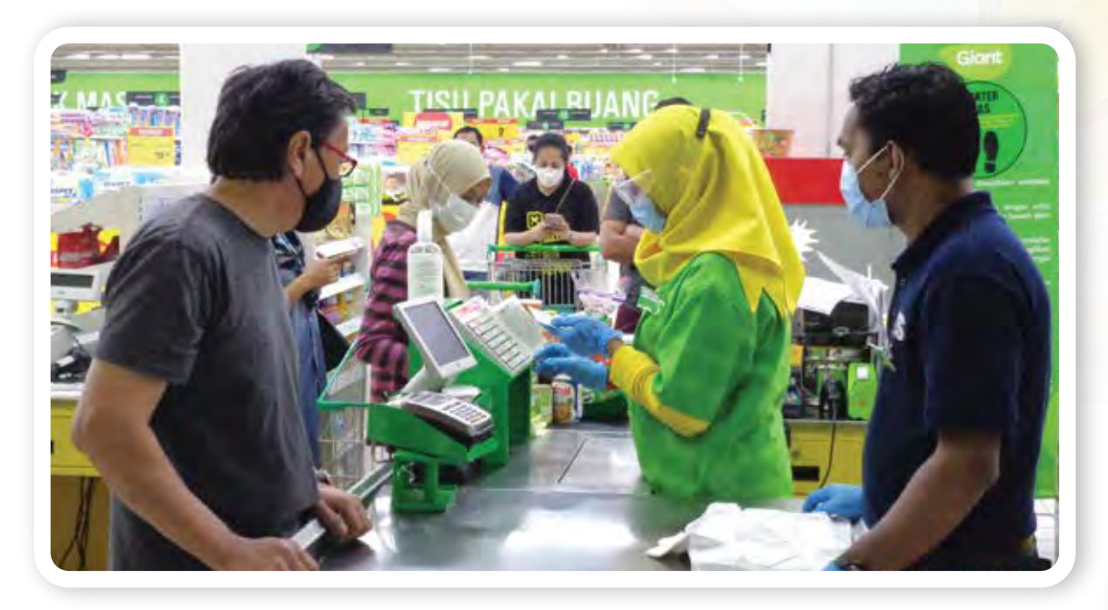
MyKasih's unique cashless welfare system allows beneficiaries to pay for groceries using their MyKad.

What if your MyKad can be used as a debit card to purchase food? That's exactly what MyKasih's unique welfare distribution technology offers Malaysia's poor.