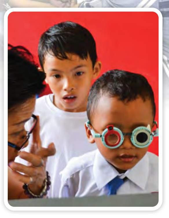
A Temuan Orang Asli student in Sekolah Kebangsaan Bukit Lanjan (A), Damansara Perdana, Selangor getting his vision screened.

Separately, in partnership with the Rotary Club of Puchong Centennial, close to 1,000 MyKasih students have had their vision screened and 180 prescription spectacles have been distributed since April 2019.