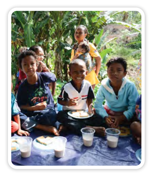
Jahai Asli children in Gerik, Perak, drinking their daily ration of fortified milk under the Ministry of Health's Community Feeding Programme.

by providing students with one complete healthy meal each day following MOH's guidelines, which also include milk powder and multivitamins. Basic healthcare training is also provided to OA community representatives so that any health-related case can be addressed efficiently.