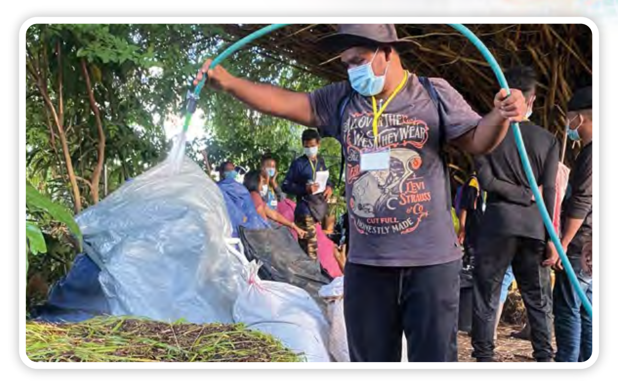
The Gerik OA have learnt to produce organic fertiliser via composting, with the hope of increasing their crop yields.

A key focus area for MyKasih is the development of the Orang Asli community, both with education and with economic transformation.