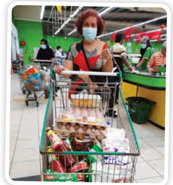
Beneficiaries are able to purchase essential food items that can last for a month or more with cashless aid.

MyKasih beneficiaries use their MyKad to purchase essential food items. Many government agencies and corporate donors have engaged MyKasih to distribute food aid to the needy during MCO.