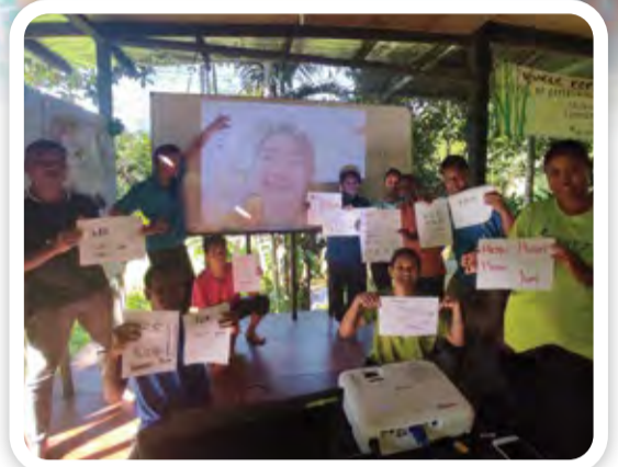
GKC students presenting their SWOT analysis in class.

The food security and economic livelihood initiatives mainly involve farming projects such as fruits, vegetables, fish, chicken and stingless bees (for honey). Over the last two years, selected Asli villagers in Perak and Pahang have been taught the basics of farming, both practical and theory. They are also taught additional skills such as composting for fertilizer, electrical wiring, irrigation management and basic computer skills. These villagers have since set up their own farms with MyKasih donors providing the initial funds required for seeds or seedlings, livestock and infrastructure. As the farms start to produce and yield harvests, they will provide sustainable food security and livelihood for the villagers.