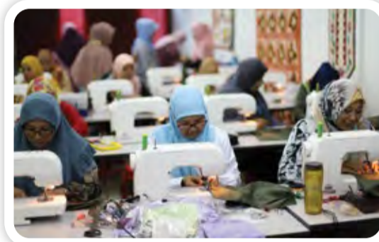
Women use their sewing skills to earn supplementary income.

With funding support, MyKasih will be able to reach out to more women as well as expand its skills and entrepreneurship training programmes.