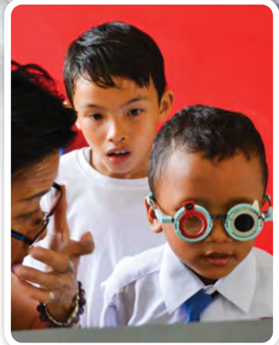
A Temuan Orang Asli student in Sekolah Kebangsaan Bukit Lanjan (A), Damansara Perdana, Selangor getting his vision screened.

In addition to food insecurity, Malaysia's low-income demographic face various health challenges particularly related to non-communicable disease and poor mental, nutritional and physical function. Although public healthcare is heavily subsidised in Malaysia, access and awareness is low among the low-income population, especially in Asli communities.