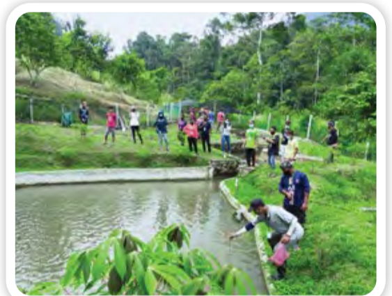
Livelihood programmes such as fish farming provides food security as well as sustainable income.

In addition, MyKasih sponsored vocational studies for 11 Asli youths at the Guwas Kuposizon College (GKC) School for Experiential and Entrepreneurship Development Sabah (SEEDS) run by PACOS Trust. After two years, the graduates have returned to their respective villages to share their new-found skills with their community. They have begun producing and selling organic fertilisers, handicraft, as well as establishing their food farms using new cultivation techniques.