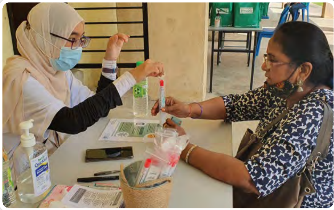
A ROSE Foundation staff explaining to a woman how to use the self-sampling ROSE kit.