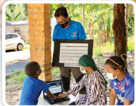
Students of SK Sungai Rual in Jeli, Kelantan, in a robotics workshop in preparation for the Virtual National Robotics Competition (VNRC).

MyKasih is a partner to the East Coast Economic Region Development Council (ECERDC) and the Northern Corridor Implementation Authority (NCIA) since 2017 and 2019 respectively on the ‘empower@academik’ programme. The programme is dedicated to aid students from underprivileged and low-income households in the northern and eastern regions with cashless bursaries and other educational