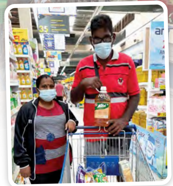
Cashless food aid returns the dignity of choice to recipients.