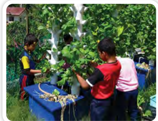
Students of SK Batu 14 in Tapah, Perak, getting hands-on learning of vital life skills such as growing their own food.

assistance. A key focus of the programme is to boost STEM education among the rural students, especially in the Orang Asli community. So far, 37 schools – including Asli ones – have benefitted from this partnership.