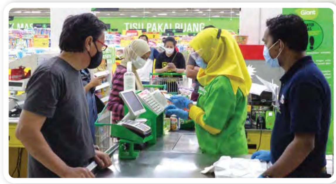
MyKasih's unique cashless welfare system allows beneficiaries to pay for groceries using their MyKad.

What if your MyKad can be used as a debit card to purchase food? That's exactly what MyKasih's unique welfare distribution technology offers Malaysia's poor.