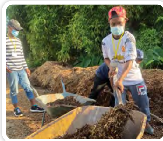
Farming and composting are key skills for the Orang Asli community.