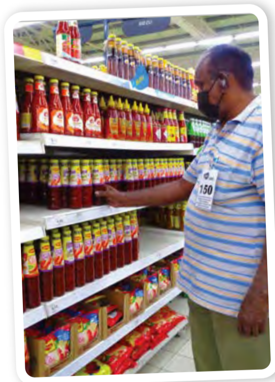
MyKasih beneficiaries are given the freedom to buy what they need and when they need it.

Over the last decade, many donor companies have engaged MyKasih as its CSR partner. It's allowed the foundation to expand its programmes and reach out to an even wider group of the underprivileged. In addition to its food aid programmes, MyKasih also focuses on the following community outreach efforts; Student Bursaries, Orang Asli Children's Development, Health Awareness, Financial Literacy and Skills and Entrepreneurship Training.