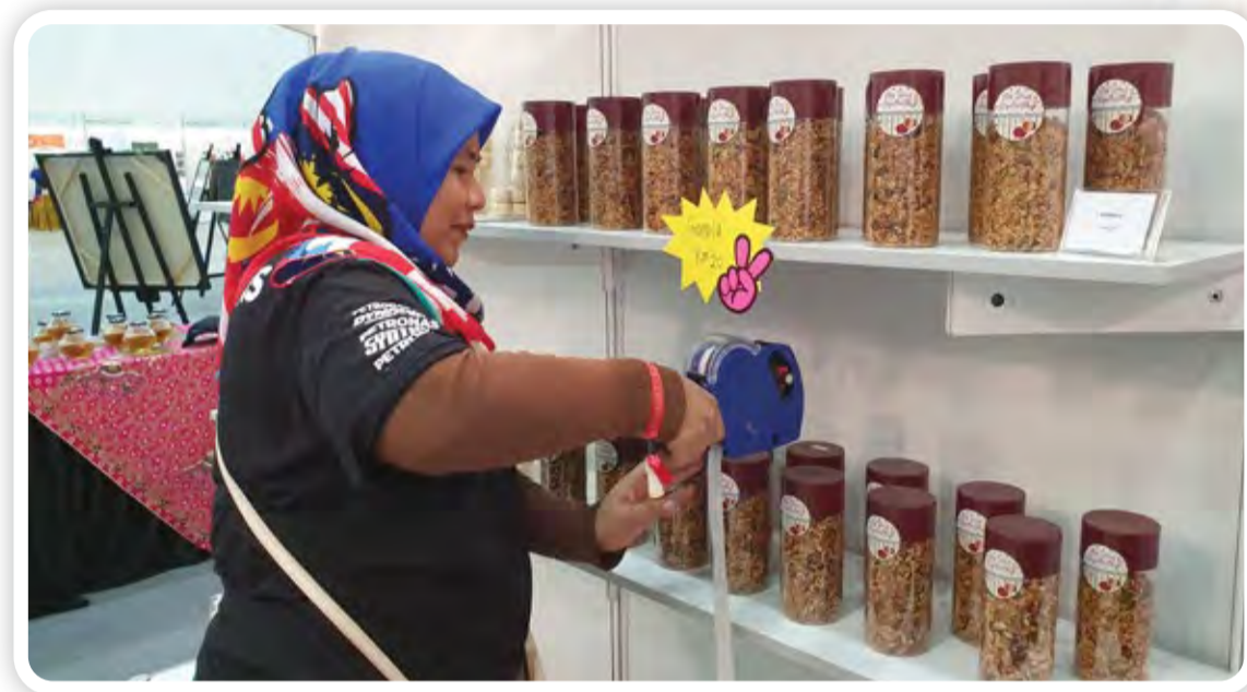
Participants are taught how to set up their cottage businesses and market their products.

There is a famous proverb that goes, "Give a man a fish and you feed him for a day. Teach him to fish and you feed him for a lifetime."