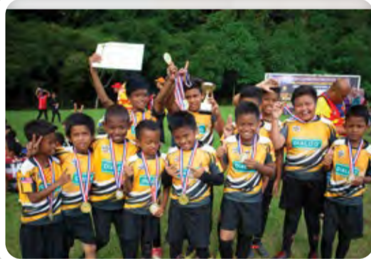
The Lanjan Tigers of SK Bukit Lanjan Asli in Selangor have been on a winning streak since their formation in 2015.

To date, the “Love My School” programme has disbursed more than RM30 million which has helped over 56,000 students – both primary and secondary – across 112 schools. Several of MyKasih’s corporate donors, such as DIALOG, Linaco, Padini, ConocoPhillips, SC Johnson and Rotary, have adopted schools as part of their long-term CSR initiatives.