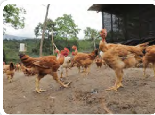
The villagers of Kg Bertang in Pahang are rearing chickens to earn a living.

Orang Asli communities encompass handicraft production, electrical wiring skills, computer literacy, organic vegetable farming, rubber tree planting, chicken farming and composting.