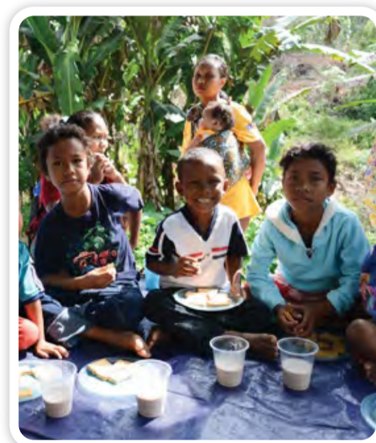
Jahai Asli children in Gerik, Perak, drinking their daily ration of fortified milk under the Ministry of Health's Community Feeding Programme.

by providing students with one complete healthy meal each day following MOH's guidelines, which also include milk powder and multivitamins. Basic healthcare training is also provided to OA community representatives so that any health-related case can be addressed efficiently.