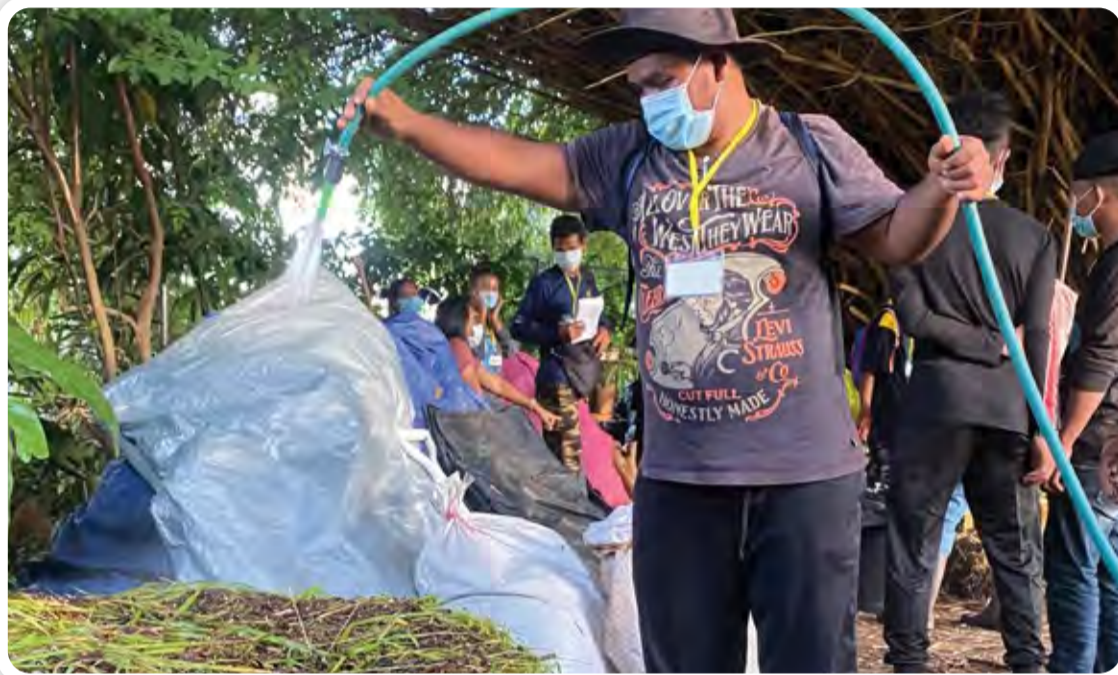
The Gerik OA have learnt to produce organic fertiliser via composting, with the hope of increasing their crop yields.

A key focus area for MyKasih is the development of the Orang Asli community, both with education and with economic transformation.