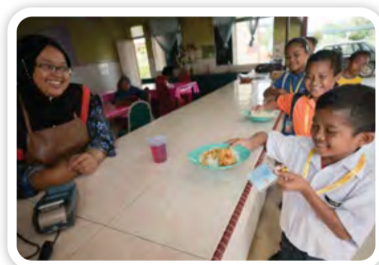
Students use their smartcards to pay for their meals at the canteen.

MyKasih began its “Love My School” bursary programme in 2012 to help students from low-income families overcome these handicaps. Students are given annual bursaries via a smartcard linked to their MyKad, to pay for meals at the school canteen through MyKasih’s unique cashless aid distribution system. A monthly allowance of RM60 (for primary students) or RM80 (for secondary students) is given for a year. It can also be used to purchase school books and stationery from school bookshops. For younger students, teachers and/or parents help the children budget their expenditure and help with their purchases. Towards year-end, additional sponsorship is provided for back-to-school supplies including uniforms, shoes, bags and stationery.