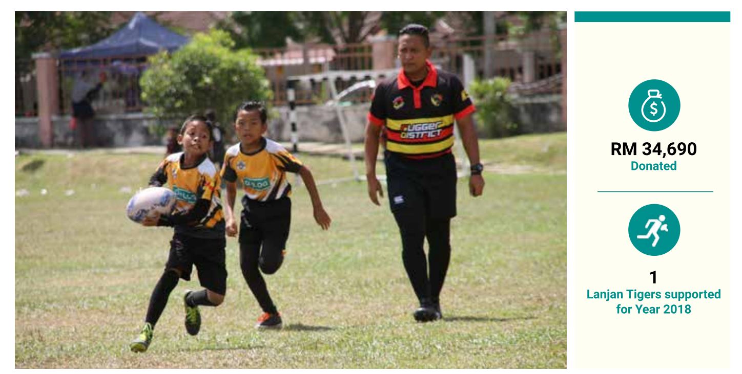
Tiny, but mighty. SK Bukit Lanjan's Lanjan Tigers under-10 rugby team have grown stronger and more confident on the field with consistent training and exposure to tournaments.

ith DIALOG's support, Sekolah Kebangsaan Bukit Lanjan's under-10 rugby team, the Lanjan Tigers, participated in the Wawasan Invitational 7's Cup 2018 nationals on 11 August at Sekolah Kebangsaan Wawasan in Seremban, Negeri Sembilan.