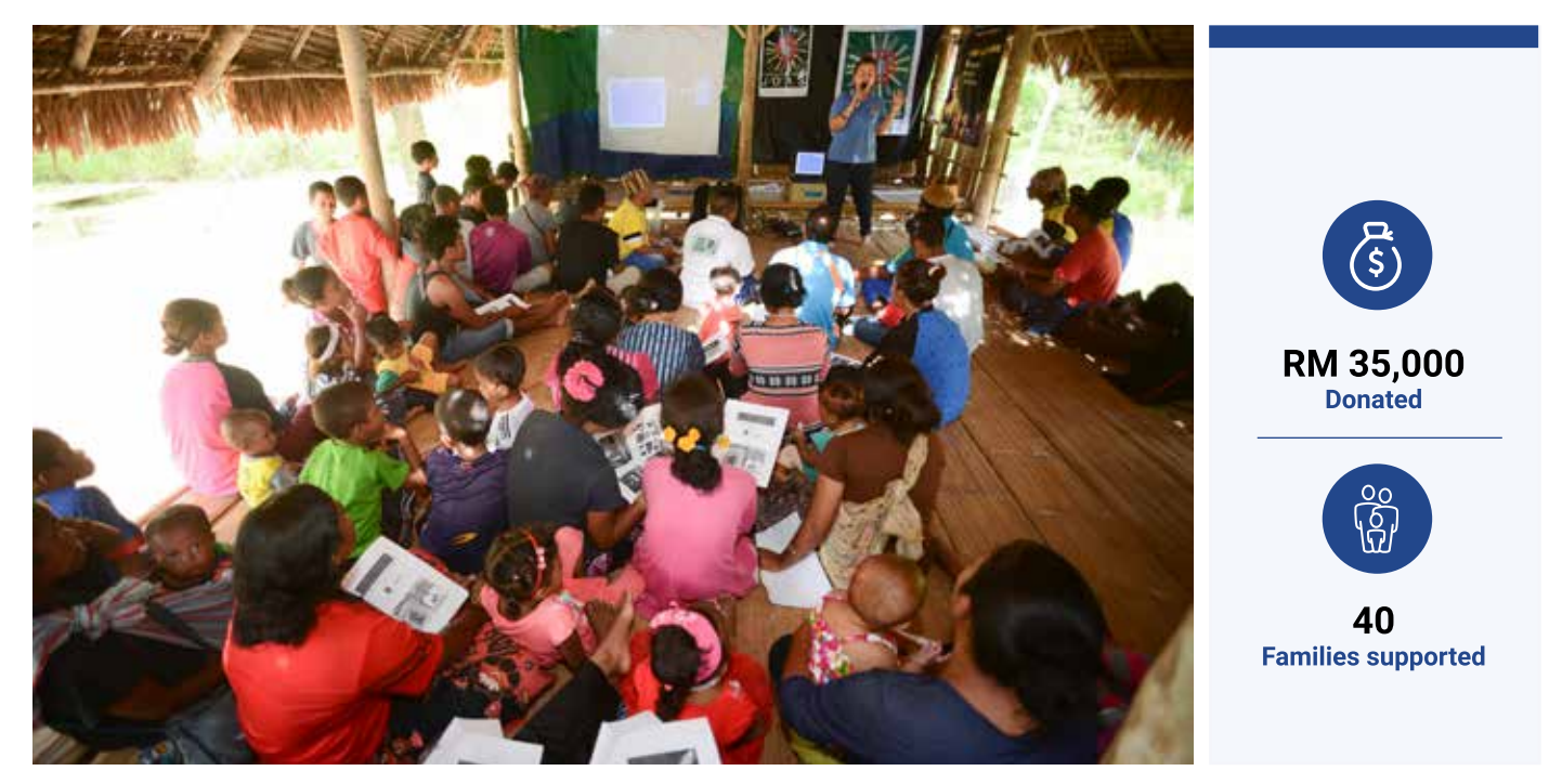
The Pos Piah Temiar Orang Asli community gathered at Kampung Kedled for a one-day financial literacy workshop. The participants are recipients of MyKasih 'Love My Neighbourhood' food aid programme, where they receive a monthly allowance of RM80 for a year via their MyKad accounts to purchase essential food items at TF Value Mart Sungai Siput.

oing odd jobs as part-time labourers, selling petai (stink beans) and handicrafts are some of the ways the Temiar Orang Asli of Pos Piah in Perak earn a living. Located almost an hour and a half from the nearest town of Sungai Siput, the remoteness of the village greatly impacts the community's economic opportunities.