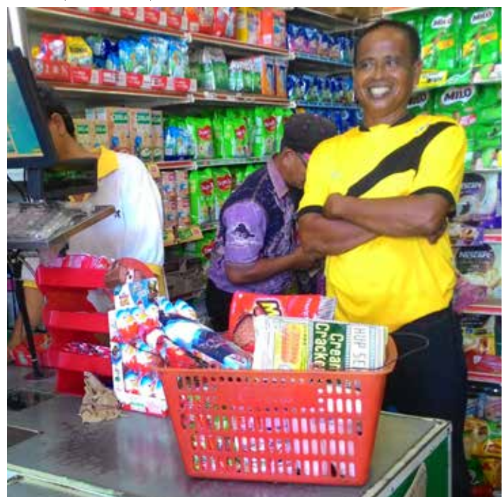
A recipient showing his basket of goods placed at the outlet's cashier counter.