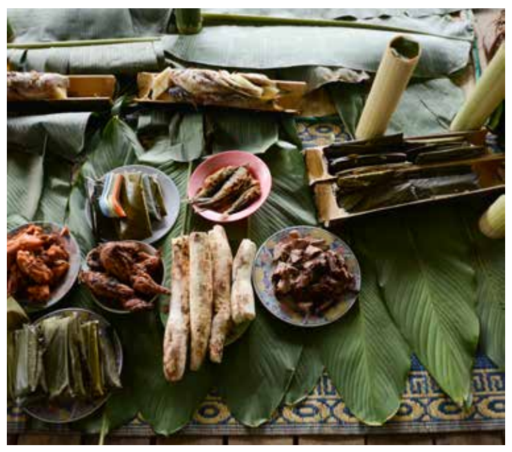
Rice, chicken and fish were cooked in bamboo, locking in the flavor and aroma.