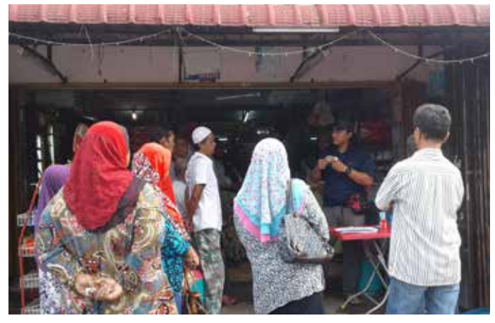
Recipients listening to a briefing session by a MyKasih officer.