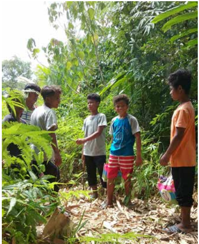
The educational trip lasted 3 days 2 nights. The students of PDK Cenwaey Penaney learnt about the uses of various forest produce.