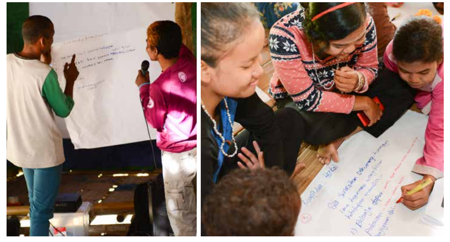
Participants listed their monthly needs which comprised of food supplies, clothes and medicine. They also took note of how money is spent unnecessarily, such as on gambling.