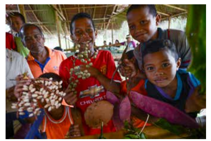
Students proudly showcasing the traditional plants collected from the forest. Many of them are learning about these plants for the first time.