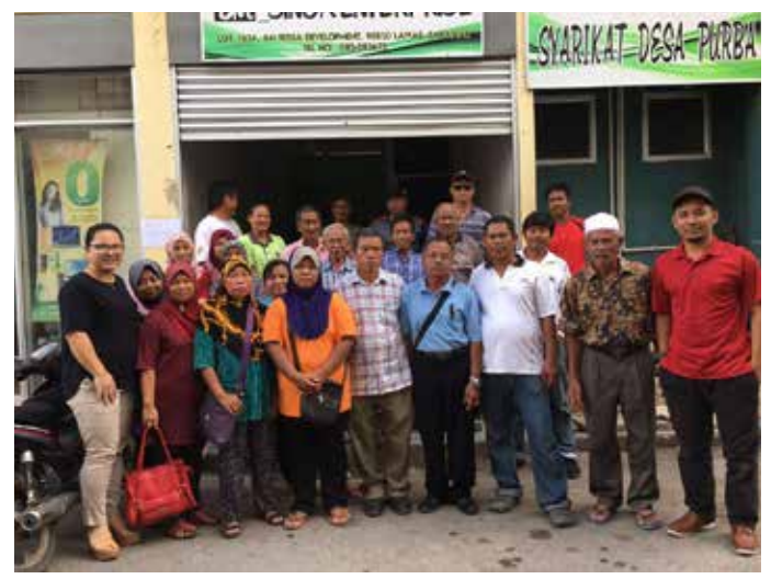
Recipients showing up for the Titipan Kasih briefing session and their first purchase under the cashless food aid programme.