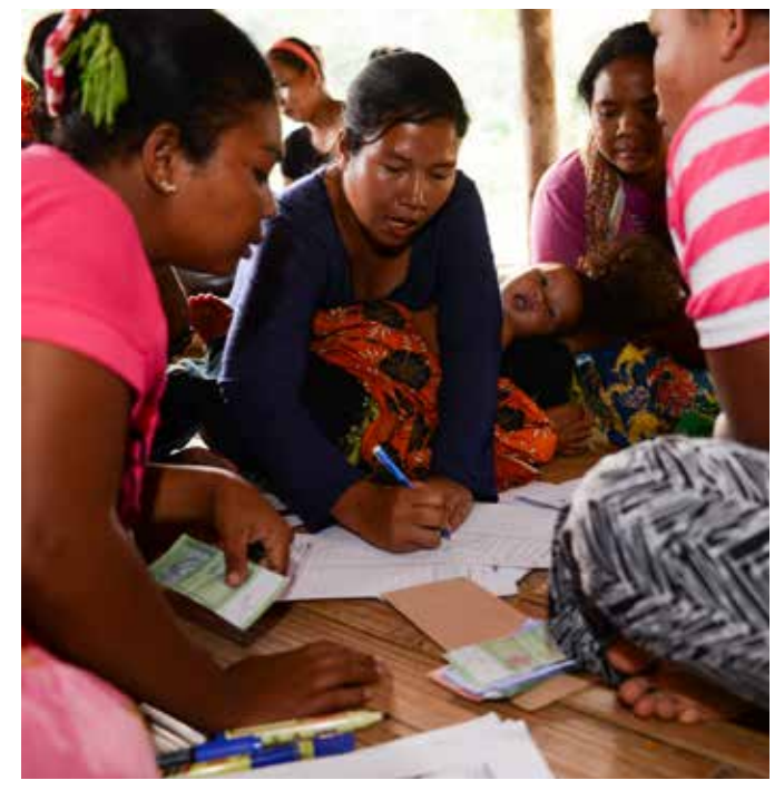
The participants were divided according to gender and age for group discussions on finance management.

The upcoming workshop will be on income generation, focusing on craft making. A Mah Meri artisan from Carey Island, Selangor and two Temiar artisans from Gua Musang, Kelantan, will share their craft-making skills using pandanus and rattan as materials.