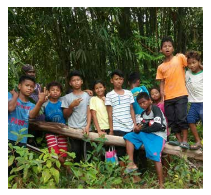
For Orang Asli children, the jungle is their classroom.

understand important concepts of nutrition and healthy living, as well as biodiversity. Edible garden projects also help educators teach languages, mathematics and science in a fun way. We are excited to be given this opportunity to support a culturallyimportant educational activity such as this one. We hope more community learning centres and schools will adopt this activity module for their students."