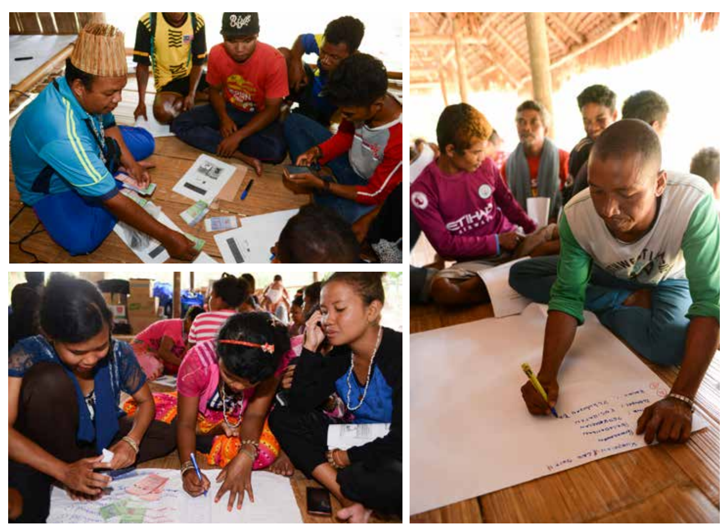
Participants listing down their monthly expenses and preparing a budget plan.