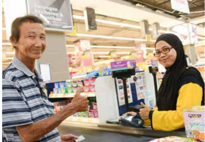
A thumbs up from an elderly recipient and the cashier for the user-friendly method of paying for his groceries using his MyKad.