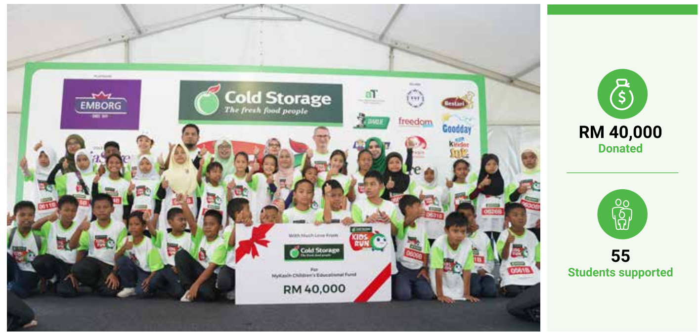
40 MyKasih student beneficiaries from SK Bukit Lanjan (Asli) Damansara Perdana participated in the Malaysia Day Kids Run and the cheque presentation ceremony by Cold Storage.

old Storage Malaysia organised a Kids Run on Malaysia Day, 16 September 2018, at Central Park, Bandar Utama, Petaling Jaya. The event brought cheer to 40 MyKasih student beneficiaries of Sekolah Kebangsaan Bukit Lanjan (Asli) Damansara Perdana, who partook in the run alongside 1,200 other children and their parents.