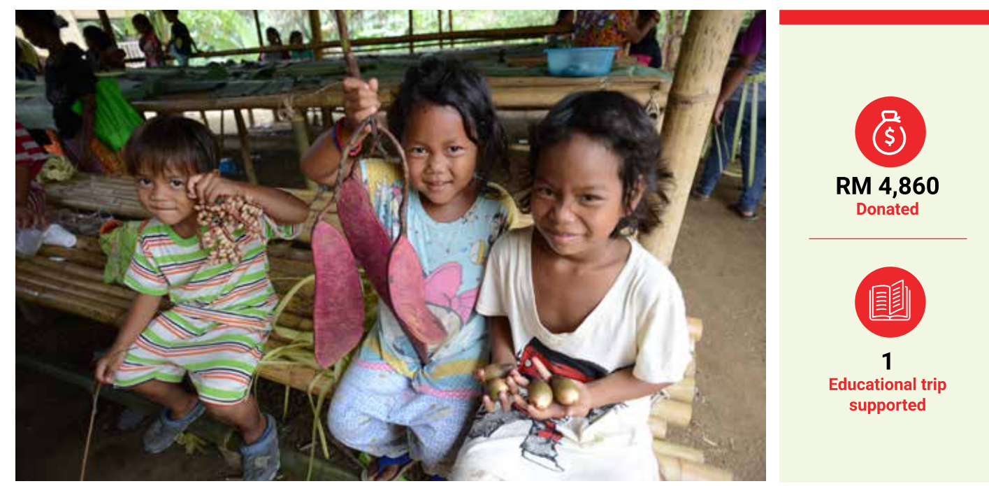
Students of PDK Cenwaey Penaney learning center holding up forest fruits and plants that are commonly used for traditional medicinal purposes. These fruits and plants were displayed during their village celebration of the International Day of the World's Indigenous Peoples on 9 August.

n conjunction with the International Day of the World's Indigenous Peoples on 9 August 2018, Pusat Didikan Komuniti (PDK) Cenwaey Penaney, an Orang Asli learning center in Kampung Ulu Tual, Raub, brought their students to Camp Libong for an educational field trip.