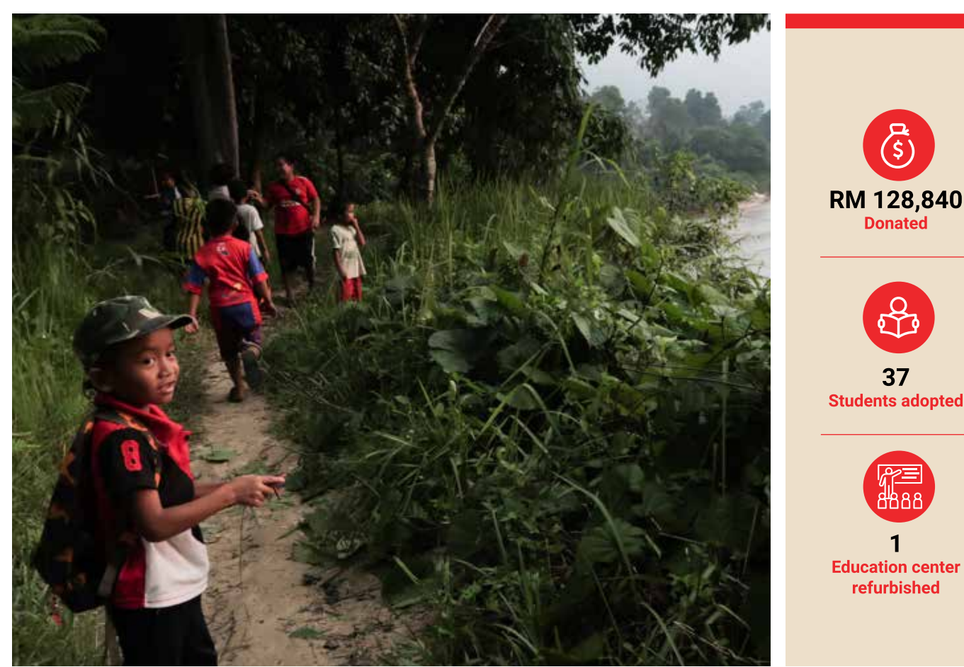
The Jakun Orang Asli live harmoniously within the forest of the Endau-Rompin National Park.

ampung Peta is a Jakun Orang Asli village of about 600 persons in 90 families located at the entrance of the Endau-Rompin National Park in Johor. Therein lies Sekolah Kebangsaan Kampung Peta, a modest school with a student population of 37. Like all the other Orang Asli students across Peninsula Malaysia, academically, they fall far behind their peers.