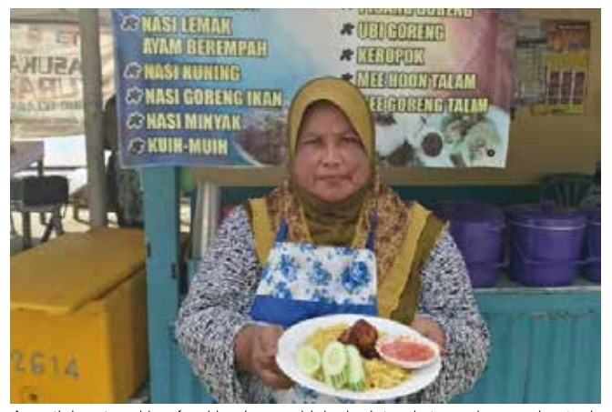
A participant and her food business which she intends to scale-up using tools and knowledge from the #KitaCipta programme.