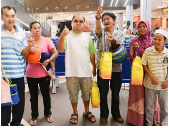
Recipients pleased with their first cashless shopping at the conclusion of the launch event.