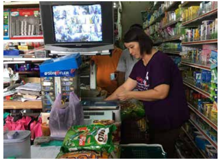
Partner retail outlets under the Titipan Kasih programme include small, but wellstocked, provisions shops such as this one.