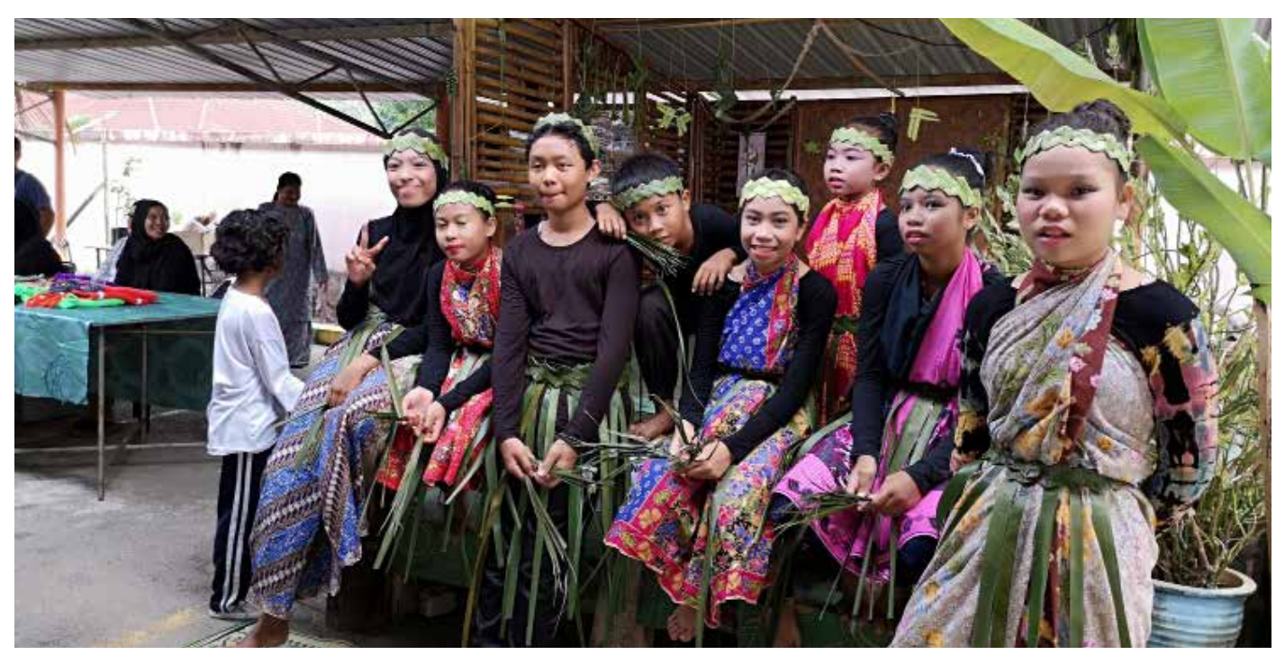
Students of SK Bukit Lanjan prepare to greet guests with a traditional performance.

he International Day of the World's Indigenous Peoples is commemorated each year on 9 August. Sekolah Kebangsaan Bukit Lanjan (Asli), a primary school for the Temuan indigenous children of Damansara Perdana, Selangor, held a celebration with its key stakeholders, namely the Ministry of Education, DIALOG Group, MyKasih Foundation, Pintar Foundation, Equinas, and the Desa Temuan community.