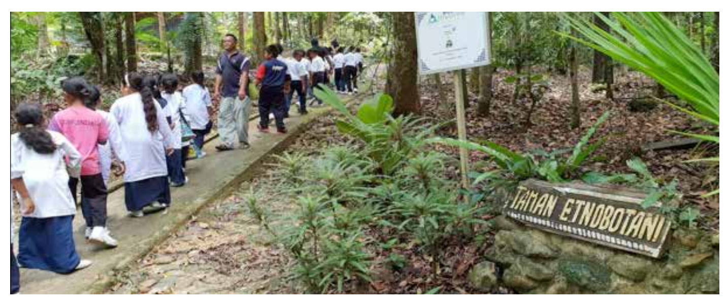
The grant also supported a 3-day educational field trip to the Endau Rompin National Park in conjunction with Science and Nature week on 8-10 October.