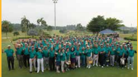
DIALOG contributed RM 200,000 towards the 2018 MyKasih Charity Golf Tournament which successfully raised RM 1.23 million.