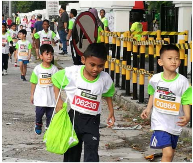
While some still had energy to run towards the finish line, many were walking as they approached the end of the course.