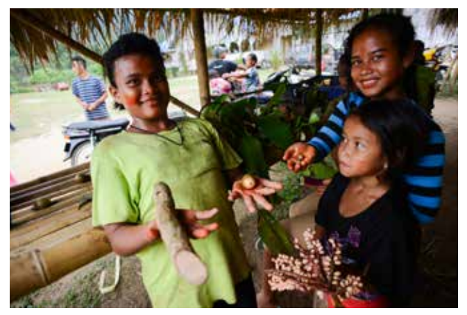
Wild roots and fruits shown by the students were used by their elders to treat various ailments.