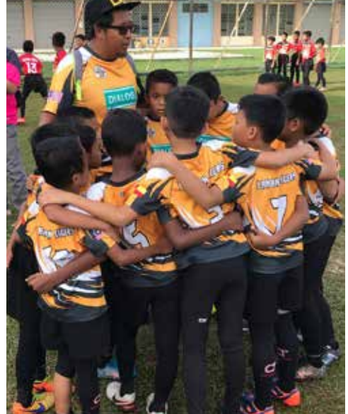
A quick huddle with their coach to plan their next play.