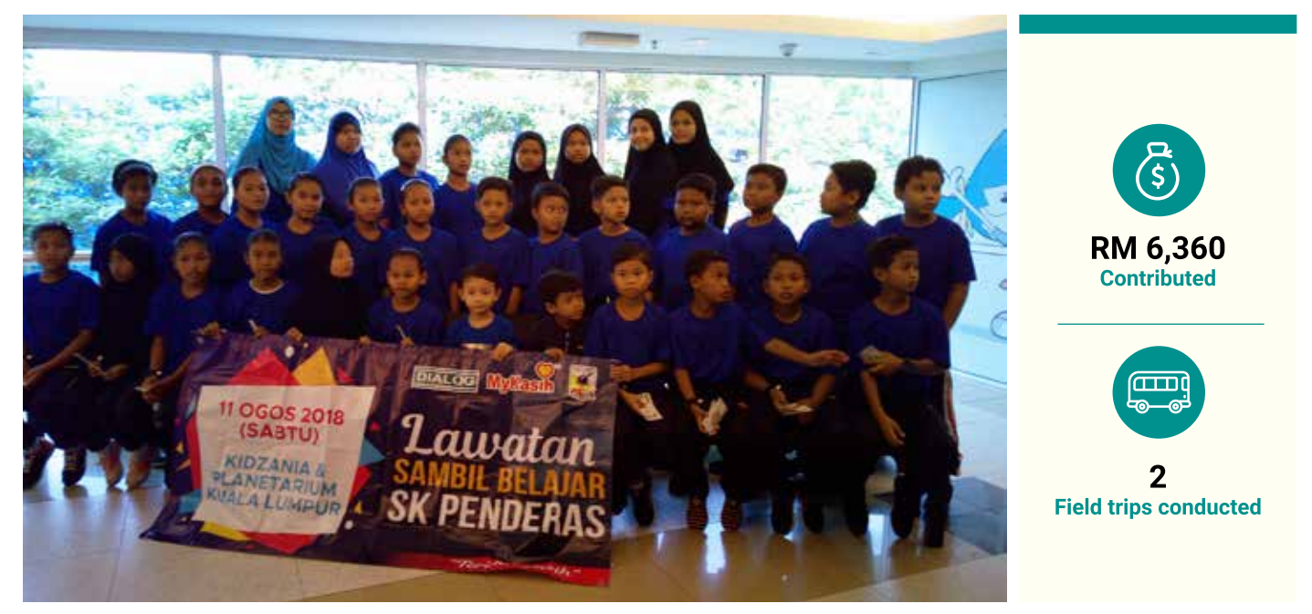
KidZania Kuala Lumpur is designed to encourage learning through role-playing activities. Featuring over 90 professions working within a real economy, KidZania allows kids to transcend the boundaries of the grown up world to play their part in a community and also experience the tricks-of-the-trade of their dream careers.

n 11 August 2018, 69 Orang Asli students and 17 teachers from Sekolah Kebangsaan Penderas, an Orang Asli school located in Kuala Krau, Temerloh, Pahang, were treated to a fun day out in KidZania in Petaling Jaya, Selangor, and the Planetarium in Kuala Lumpur.