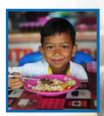
Student enjoys his meal

Donors select schools which they would like to adopt under the MyKasih 'Love My School' Bursary Programme.