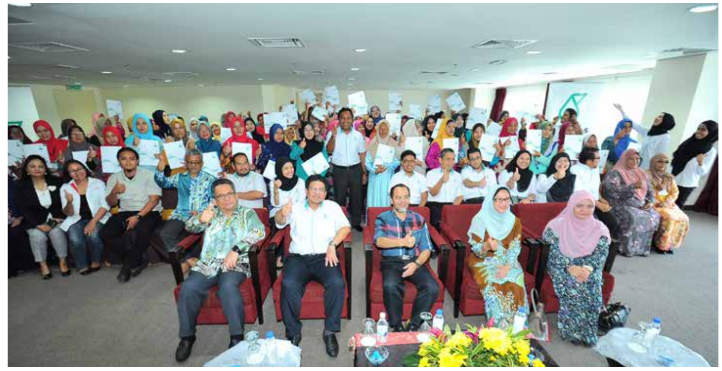
Wishing the 100 Kuala Nerus participants all the best as they embark on the six-month #KitaCipta Planting Tomorrow programme.