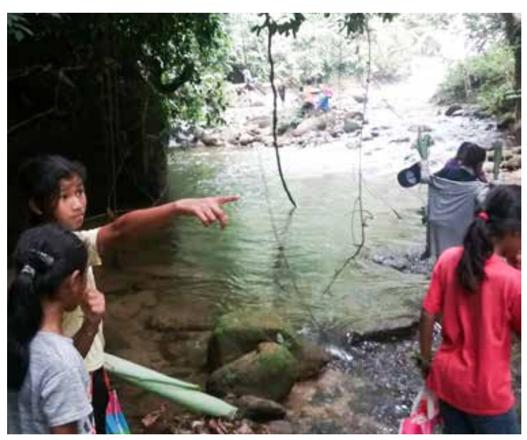
This outdoor classroom style of teaching and learning is practiced in PDK Cenwaey Penaney, incorporating traditional knowledge with mainstream education.