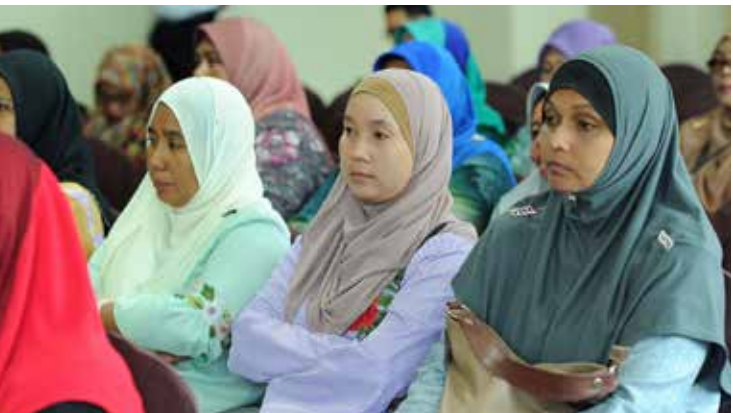
Participants listening to the overview of PETRONAS' #KitaCipta Planting Tomorrow programme and its mission to assist low-income households in improving their quality of life.