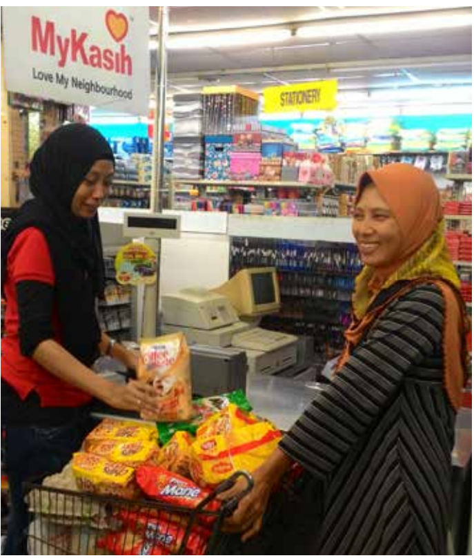
Happy to fill the supermarket trolley with essential food items for her family.