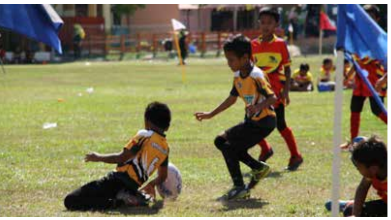
Two Lanjan Tigers work together towards a try.