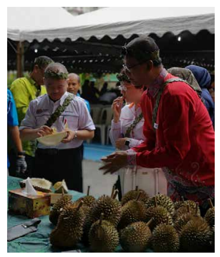
Representatives of the Ministry of Education sampling local fruits served by the school.

MyKasih Foundation currently supports close to 8,000 students in 106 schools through the 'Love My School' bursary programme, out of which, about 4,500 student beneficiaries in 30 schools are Orang Asli.