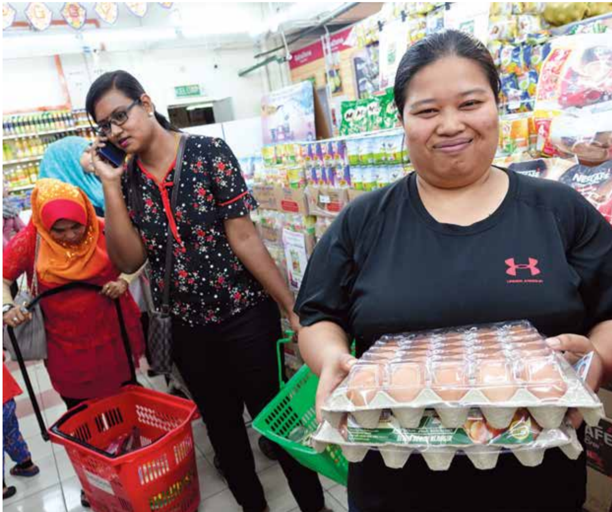
Eggs are an important source of protein for Malaysia's needy

Over the years, the list has grown. While there are essentially the same categories of staples, there are now more brands, package sizes and overall variety to accommodate changing tastes and availability. Most of the things on the list are easy to store and have a substantial shelf life.