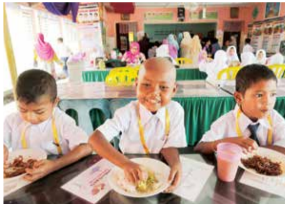
Semaq Beri boys enjoying the first MyKasih meal at SK Kuala Tahan, Taman Negara