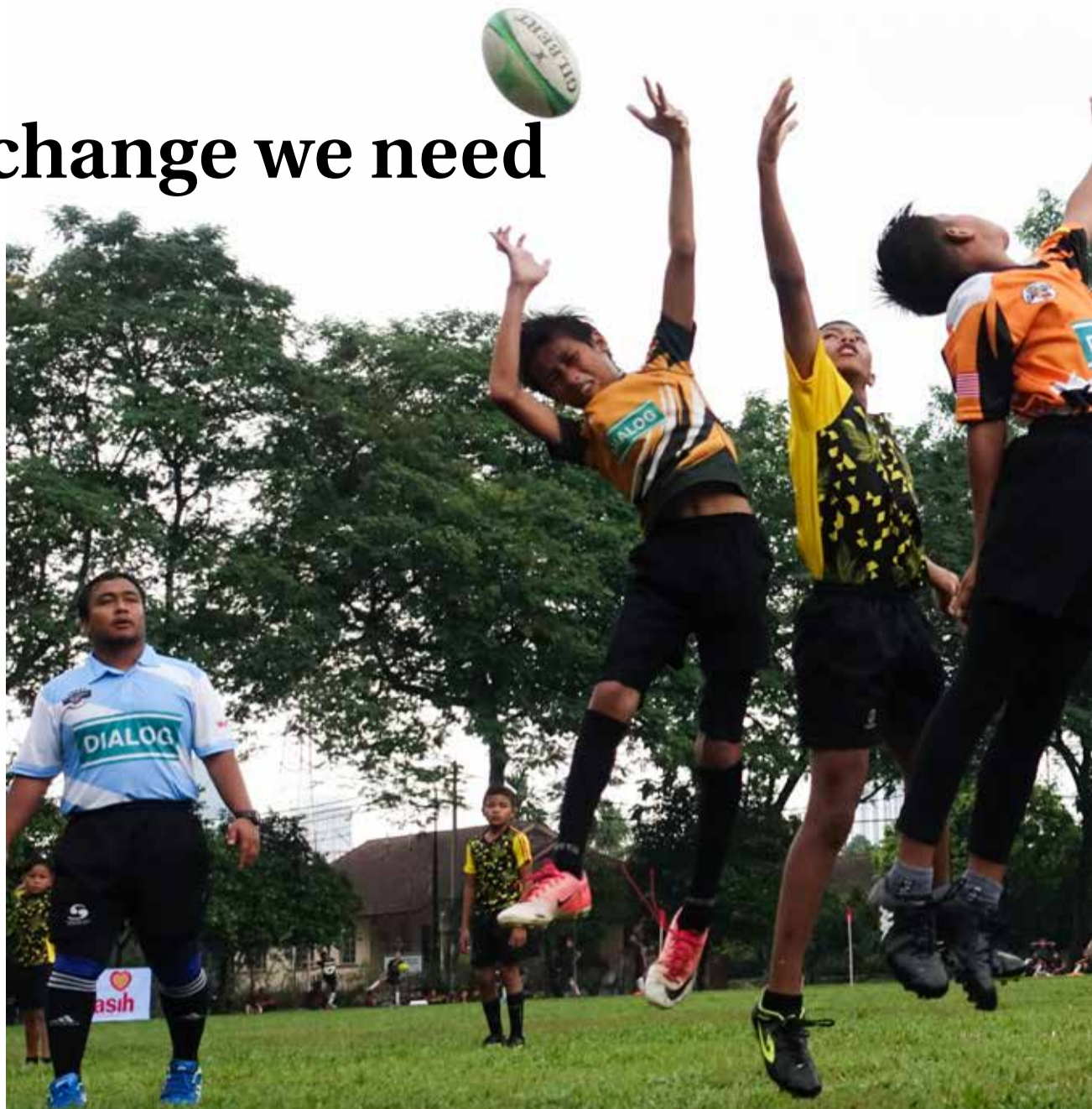
Get that ball! The Lanjan Tigers go airborne at the first-ever All Asli Rugby Championship in September 2019

MyKasih's Love My School programme runs parallel to its flagship Love My Neighbourhood initiative. By 2012, the food aid programme was well underway and some 92,000 families had already received the help they needed. It put food on the table, alleviating hunger for many families and, certainly, it gave parents a 12-month break to find long-lasting sources of income. But social work-