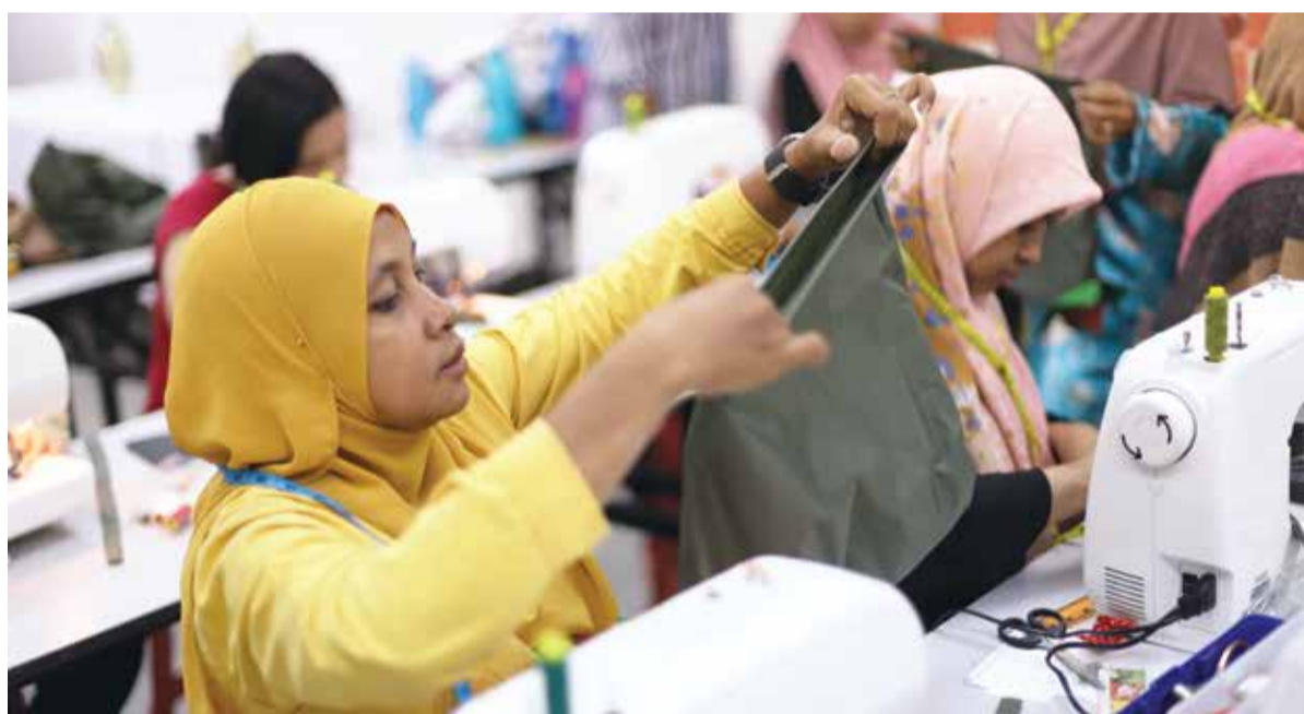
In Permatang Pauh, a participant checks her work at a sewing skills course held in December 2018