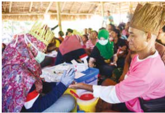
A Temiar Orang Asli from Pos Piah gets his blood glucose measured at the Kuala Kangsar Orang Asli mobile clinic

health screening zooms in on their eyesight and teeth. About 10% to 15% of screened children will need glasses. Malaysia's Ministry of Health has an effective school-based vision screening programme but there are occasional gaps and some children miss screening for one reason or another. In one MyKasih vision campaign, a Year Five schoolgirl in suburban Kuala Lumpur was prescribed eyeglasses powered at -800! Somehow, she had missed every chance for an eye check despite teachers reporting that she was slow.