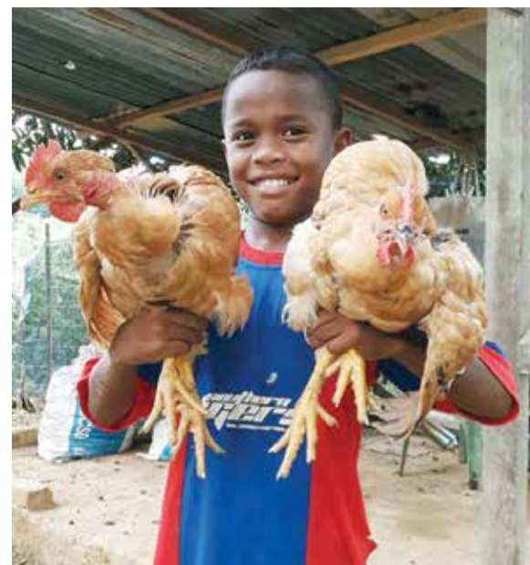
Market day at Kampung Bertang

A slightly different approach was taken for rural Orang Asli families on the food aid programme in 2018. While food aid helped substantially, social workers observed that many Temiar adults and children in the Gerik area were still un-