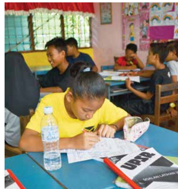
Pupils at SK Sungai Bumbun, Pulau Carey, now approach exams with confidence

In a separate effort, children from families who were at some point on the MyKasih food aid programme are helped to find scholarships to further their education through collaboration with universities and other educational institutions. ■