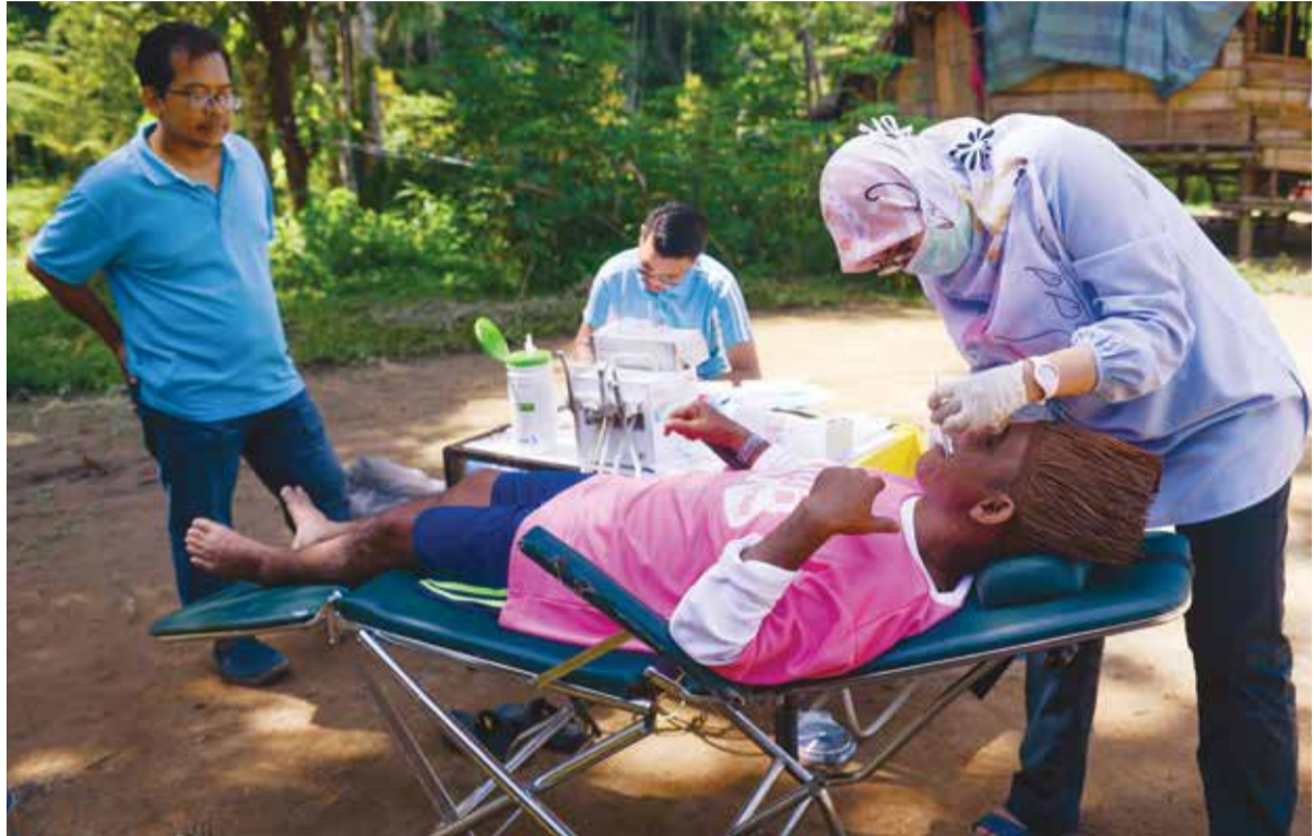
An Orang Asli elder of Pos Piah, Perak, gets his teeth checked by Kuala Kangsar dental clinic staff. This mobile dental clinic saves Pos Piah residents a costly trip to town.

For children on the MyKasih Love My School bursary,