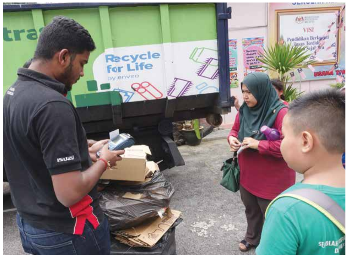
Using a handheld terminal, cash value is loaded onto the Recycle For Life smartcard

Another programme, called Recycle For Life, provides cash value through a smartcard for recyclable items. The smartcards can be used to pay for goods sold at participating stores, school canteens and bookshops. Cardholders bring recyclables to designated collection points where cash value is loaded upon exchange. More than 37,000 Recycle For Life cards have been issued to schoolchildren, university and college students, households, working adults and government agencies. ■